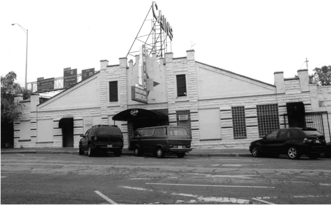
Cain's Dancing Academy